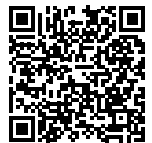
Family Member Travel Screening

Service members moving concurrently with their families can now complete specialty medical and educational clearance requirements electronically and track the status of a clearance request in real time.