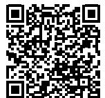
Relocation Assistance Program

Military & Family Readiness Centers have a support staff that's trained and ready to help make your move easier! From financial planning to entitlements and resources to home-finding services, they have it all.